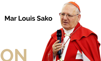
Mar Louis Sako