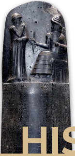
1750 BC Hammurabi introduces his Code of Laws